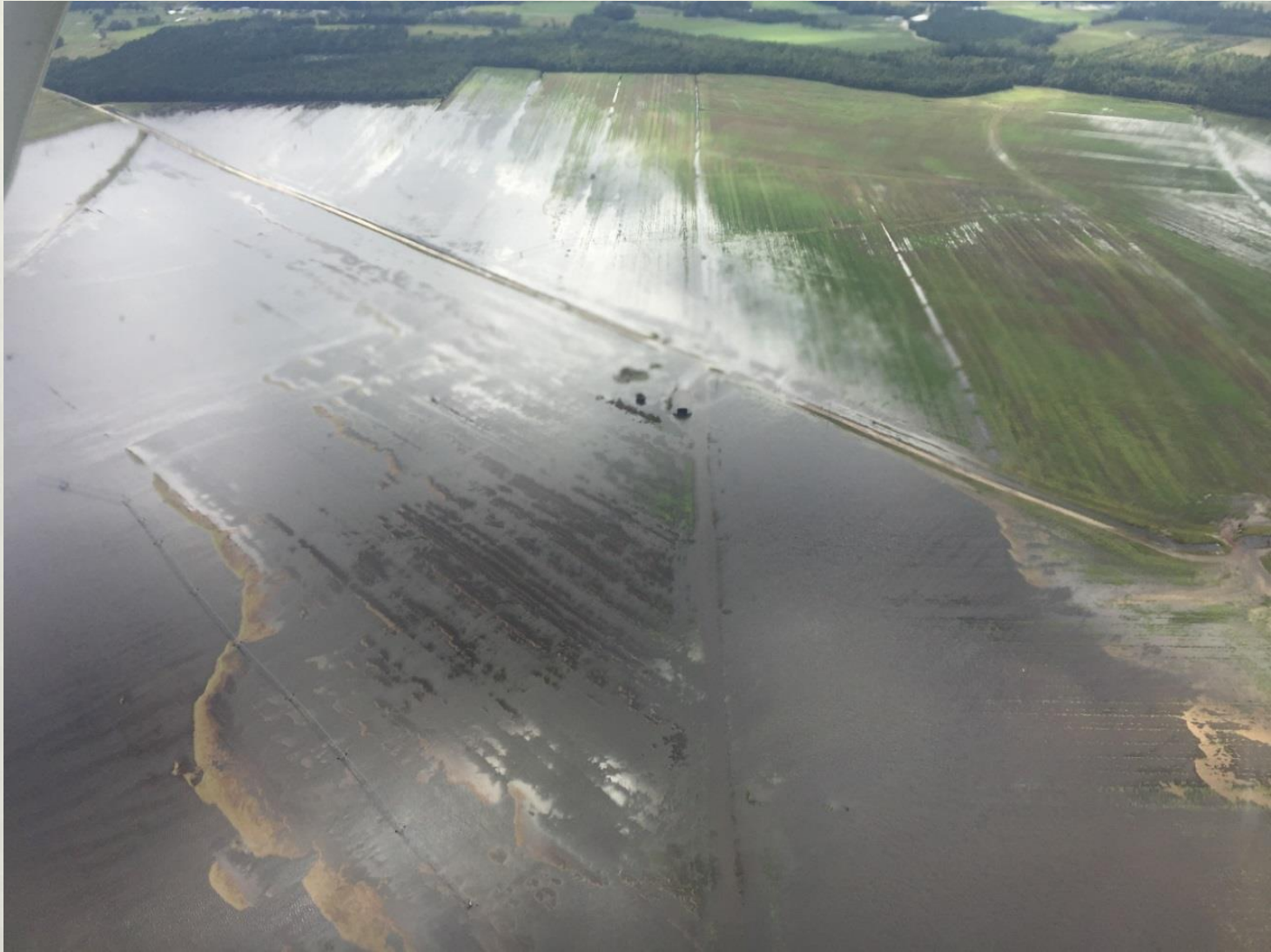
Farm in Darlington County