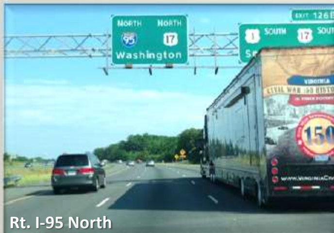
Rt. I-95 North