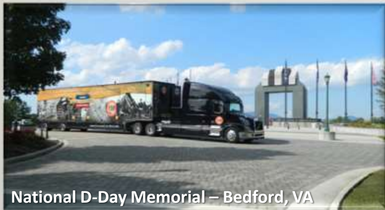
National D-Day Memorial – Bedford, VA