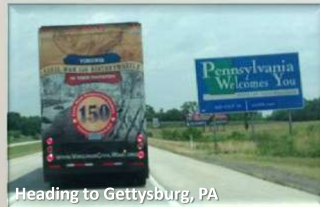
Heading to Gettysburg, PA