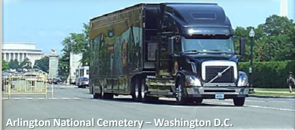
Arlington National Cemetery – Washington D.C.