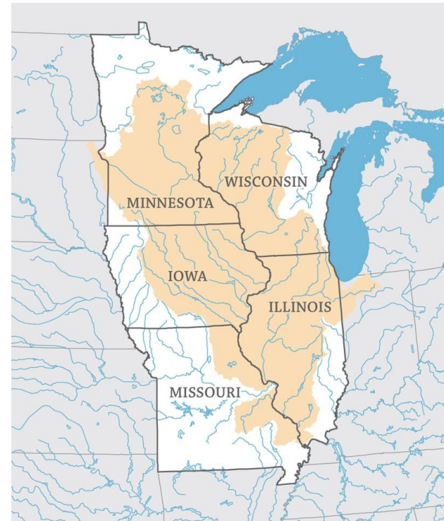
Upper Mississippi River Basin