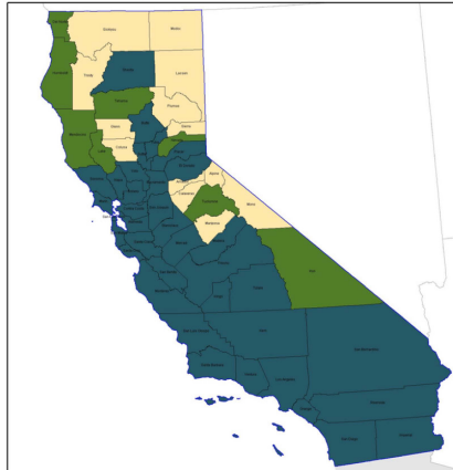
CALIFORNIA METROPOLITAN, MICROPOLITAN, AND NON-CORE COUNTIES